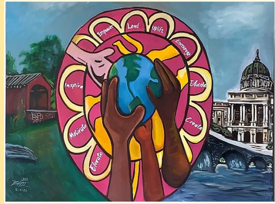
Mural Dedication on May 3, 2023