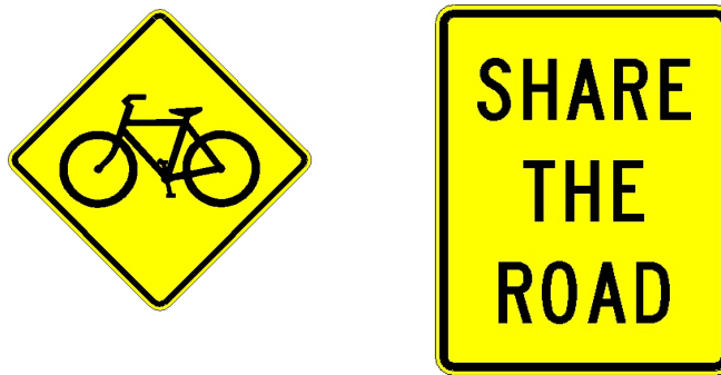
Figure C1 “Share the Road” Signage