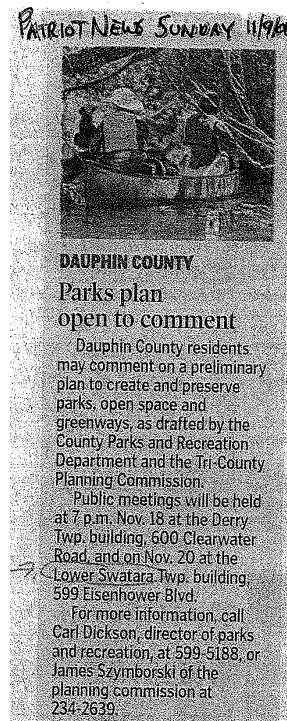
Figure A4 Harrisburg Patriot News Notice